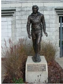
Aquatorium Gary, IN

[A 2/3 scale Red Tail P-51 also on display]