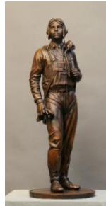
DOTA Howard Baugh Black History Museum of Virginia Richmond, VA