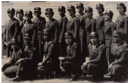
Tuskegee Army Nurses

“Tuskegee Airmen” include men and women who were involved in the “Tuskegee Military Experiment” from 1941 to 1946.