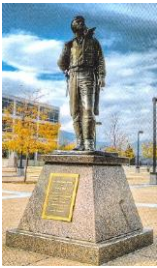
USAF Academy, Colorado Springs, CO