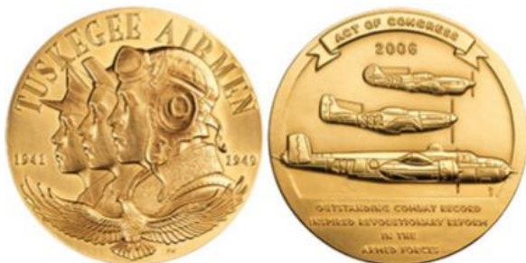
*Congressional Gold Medal (front and back) awarded to the Tuskegee Airmen