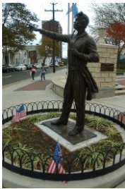
Atlantic City, NJ (same statue as Tinker)