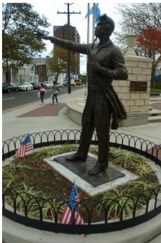
Atlantic City, NJ (same statue as Tinker)