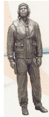
City University of New York (CUNY) Aviation Institute York College, NY