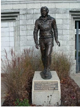
Aquatorium Gary, IN [A 2/3 scale Red Tail P-51 also on display]