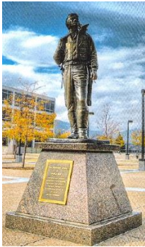
USAF Academy, Colorado Springs, CO