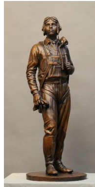
DOTA Howard Baugh Black History Museum of Virginia Richmond, VA