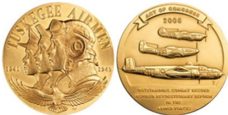
*Congressional Gold Medal (front and back) awarded to the Tuskegee Airmen