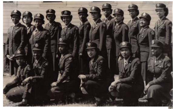
Tuskegee Army Nurses

The “experiment” is now referred to as the “Tuskegee Experience” by Tuskegee Airmen,