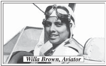
Willa Brown, Aviator