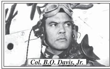
Col. B.O. Davis, Jr.