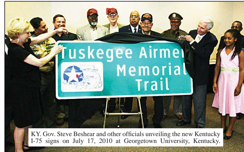
KY. Gov. Steve Beshear and other officials unveiling the new Kentucky I-75 signs on July 17, 2010 at Georgetown University, Kentucky.

There was a major difference between the Bill approved by the Colorado legislature and the one passed by the Kentucky legislature. Colorado only approved the Bill without providing funds to install their Highway designations. On the other hand, Kentucky's legislature did approve funding and authorized the Kentucky Department of Transportation to post signage on the I-75 portion around Lexington. As a result, Colorado passed their Law first, but Kentucky " put their stick in the ground first. "