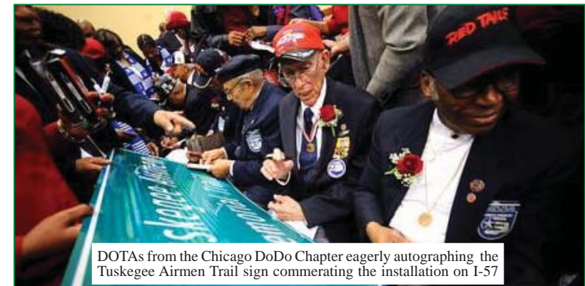
DOTAs from the Chicago DoDo Chapter eagerly autographing the Tuskegee Airmen Trail sign commemorating the installation on I-57

During the rest of 2007, 2008 and even into 2009, I personally sent letters on how to do what Kentucky did to all of the state legislative bodies along the I-75 corridor. I had the notion of wanting to make the entire I-75 corridor of 1,785 miles a designated Tuskegee Airmen Memorial Highway, beginning at Sault Ste. Marie Michigan all the way down to Hialeah Florida. Along that path, are six states beginning with Michigan, Ohio, Kentucky, Tennessee, Georgia and finally Florida.